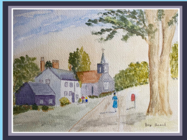
A Letter Sent Watercolour