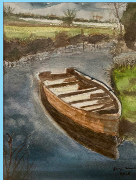
River Reflections Watercolour