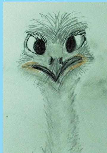
What is your Problem! Colour Pencils