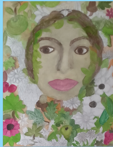
The Green Woman Mixed Media