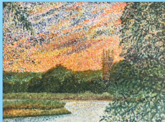
'Taw and Trinity' (pointillism) Oil