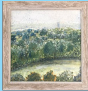
'Taw and Trinity from Bishops Tawton' Oil