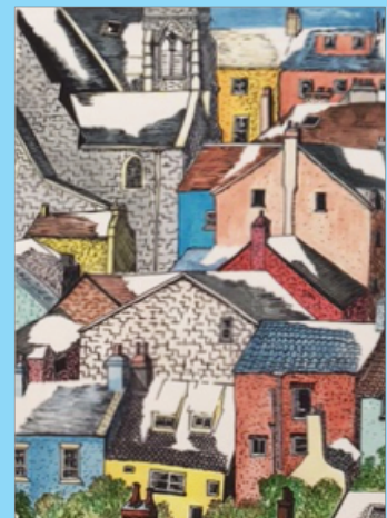
Colourful Rooftops Watercolour