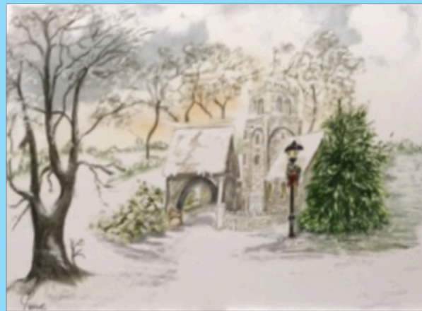
Christmas Scene Watercolour