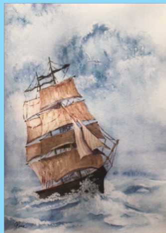
Sailing in Stormy Seas Watercolour