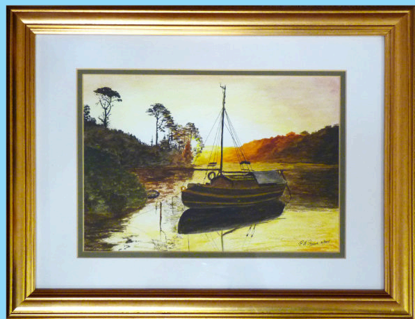
At anchor Watercolour