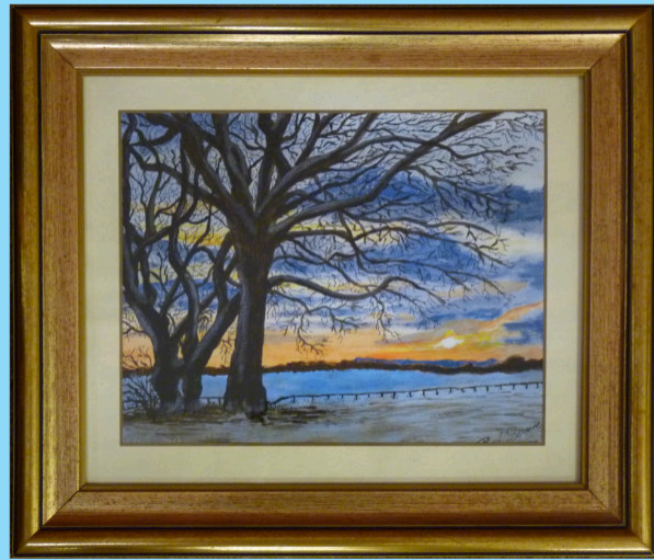
Golden Evening over Snowy Fields Acrylic